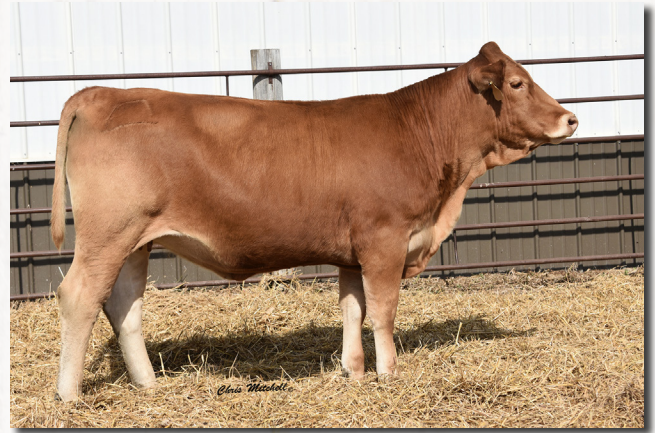
DCH HILLE J246 Sells as Lot 36