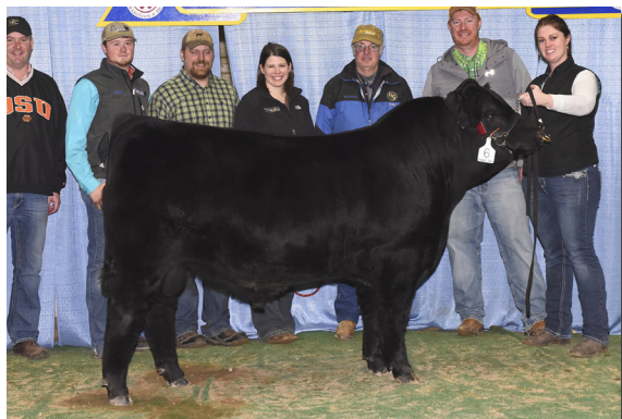
PHG EMINENCE E02 Sire of Lot A Embryos