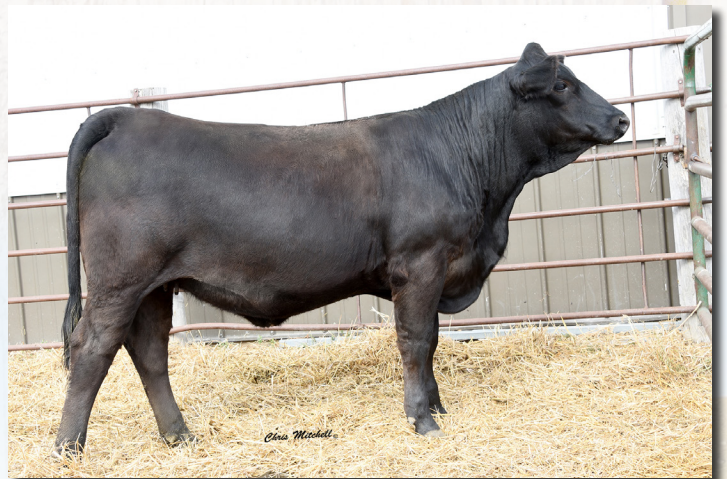
DCH HILLE 169 Sells as Lot 2

GE EPDs. Due 3/15/23 to DCH Herbie H705 with a Bull calf. BW ratio of 94, WW ratio of 109, a spread that is hard to achieve. Good EPD.s, great phenotype, and bred to the awesome Herbie H705 bull. Maternal grand dam has achieved dam of merit status 3 consecutive years. The bull calf she is carrying has great potential long before he is on the ground.