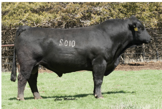
DCH X102 Full ET Brother & AI Sire to DCH A213