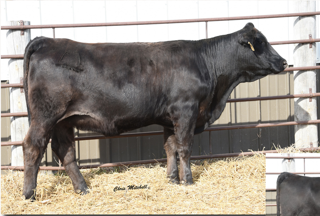
DCH HILLE J139 Sells as Lot 14