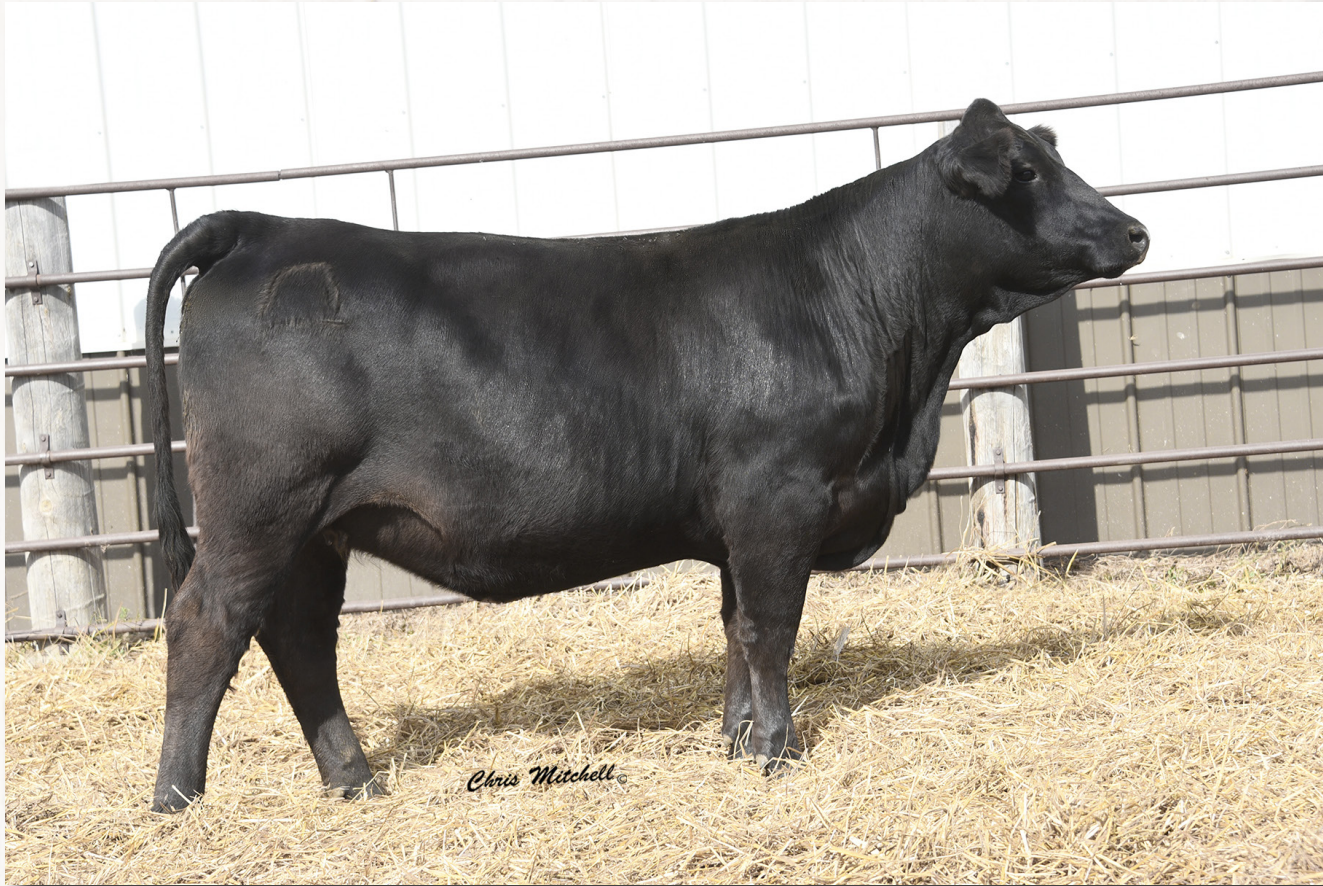
DCH HILLE J146 Sells as Lot 1.