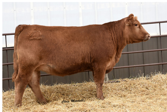
DCH HILLE G526 2020 High Selling Red Daughter of DCH A213