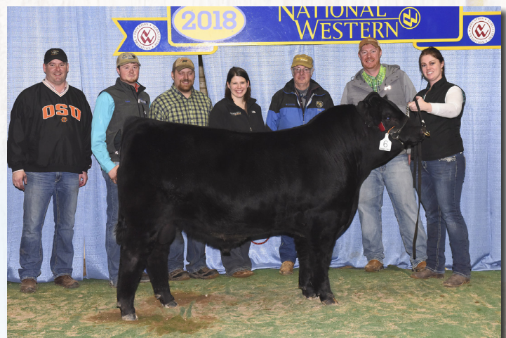
PHG EMINENCE E02 Sire of Lots 8-13

GE EPDs. Due 3/15/23 to DCH Triple K Husker G413 with a Heifer calf. This Eminence sired female has a very special maternal pedigree. The maternal great grand dam, achieved Dam of Distinction status, is also the first female we flushed. The heifer calf she carries, from G413, should also add in positive traits from the Cornhusker Red influence.