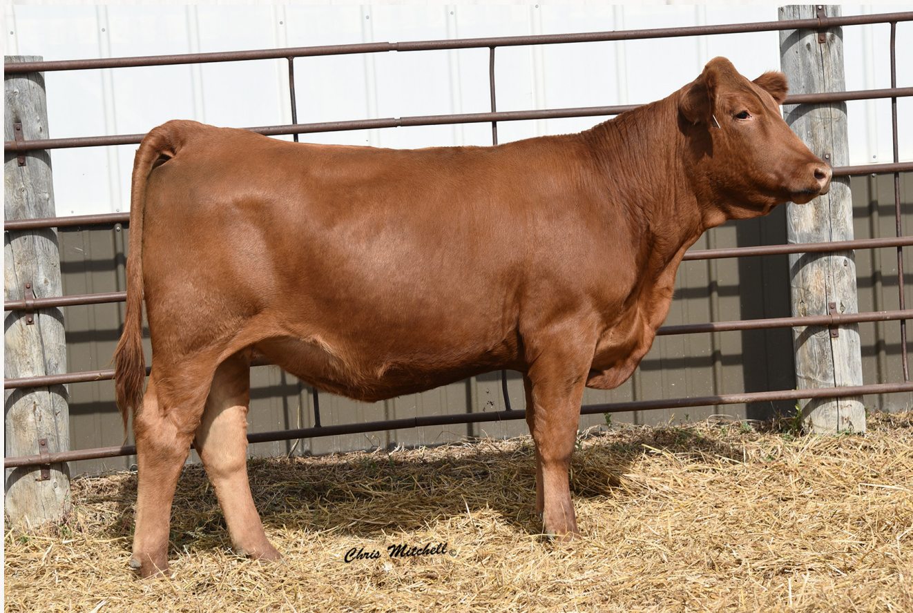
DCH HILLE J126 Sells as Lot 4