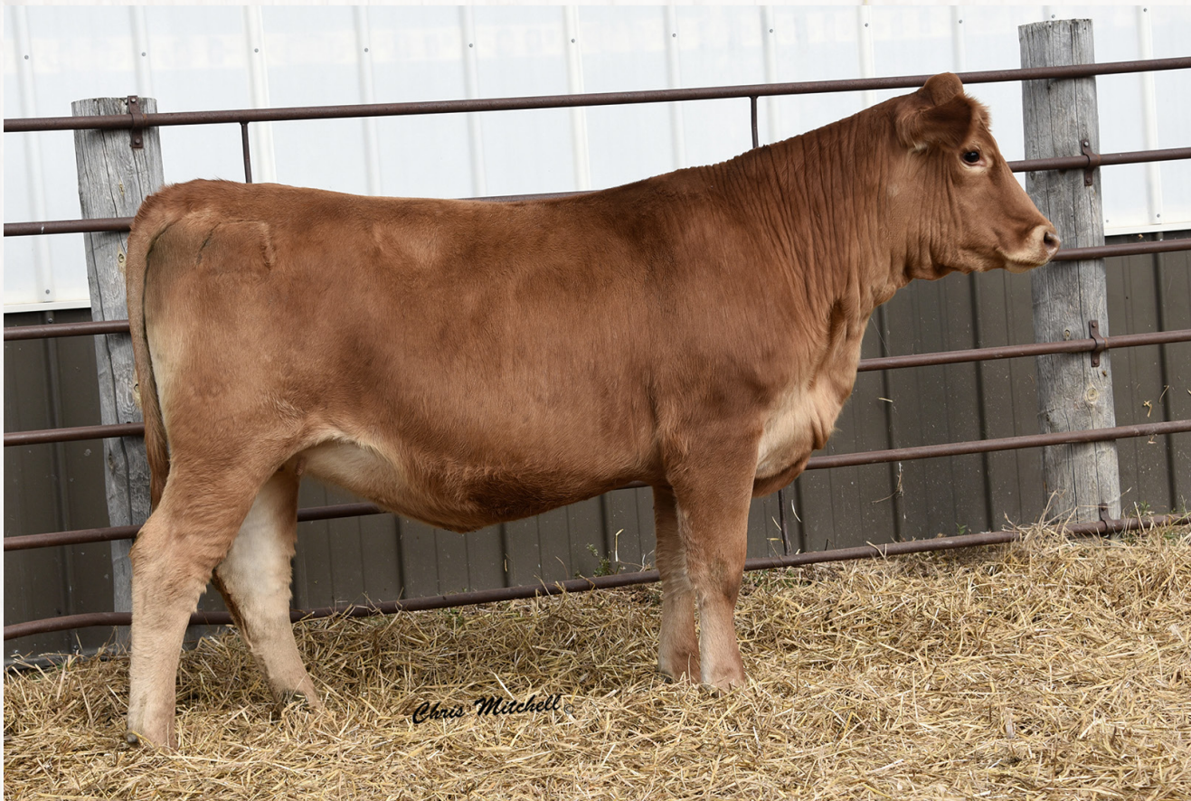
DCH HILLE J161 Sells as Lot 25