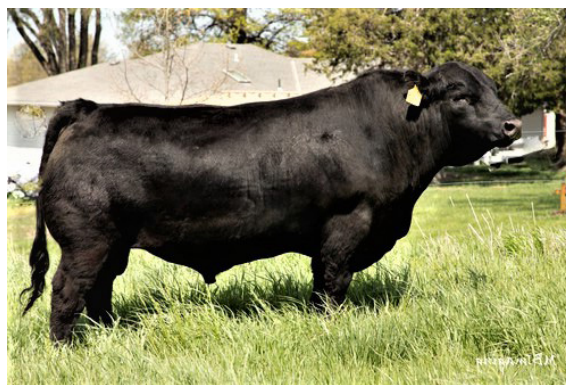
DCH TRIPLE K HUSKER G413 Sire of Lot B Embryos