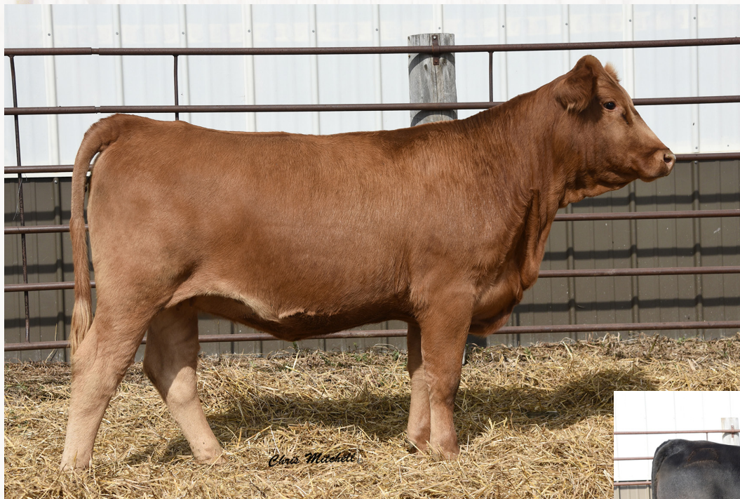
DCH HILLE J202 Sells as Lot 18.