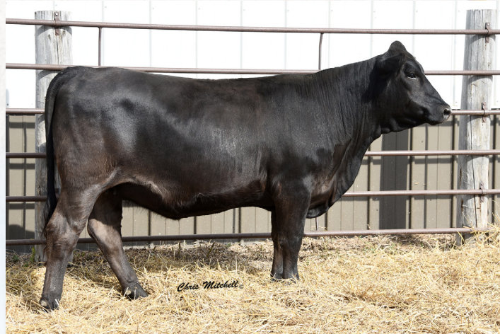
DCH HILLE J189 Sells as Lot 16

GE EPDs. Due 3/15/23 to DBRG 931G with a Heifer calf. Power, performance and style in one package. Top 1% EPD's for WW and YW, and top 4% for CW. The mating with 931G compliments the CE, BW and MB traits, while maintaining performance. This is a very good looking heifer and the heifer calf she carries should only be better.