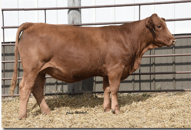
DCH HILLE J258 Sells as Lot 29