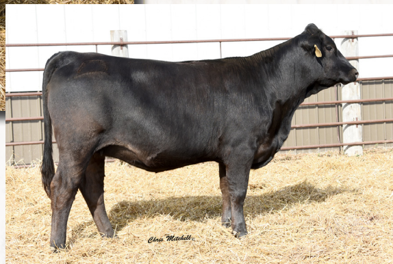
DCH HILLE J213 Sells as Lot 19