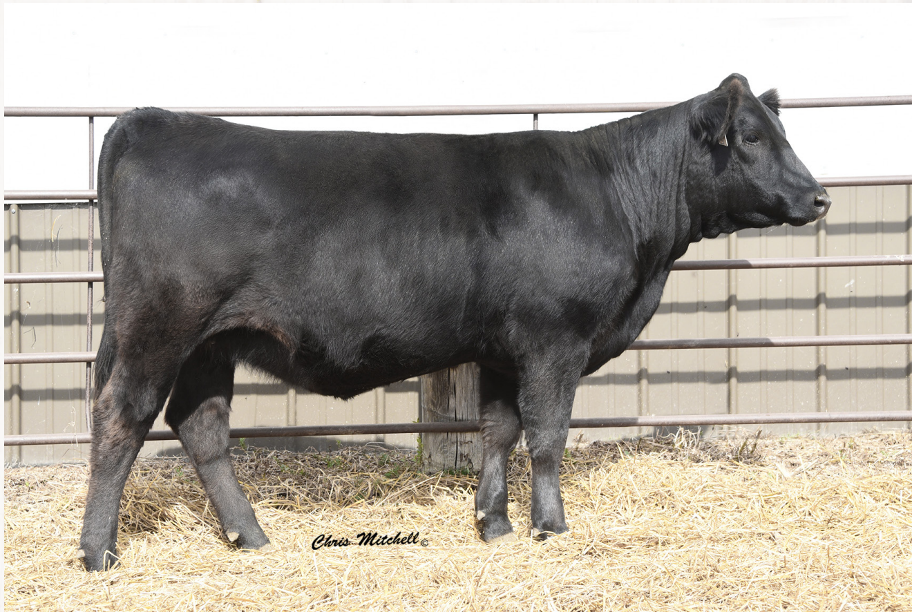
DCH HILLE J125 Sells as Lot 8.