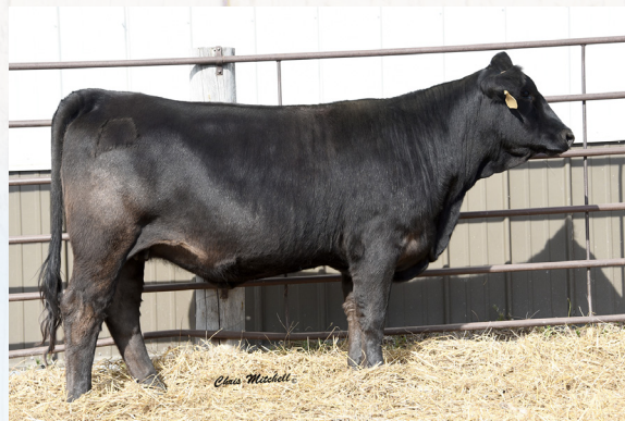
DCH HILLE J122 Sells as Lot 20