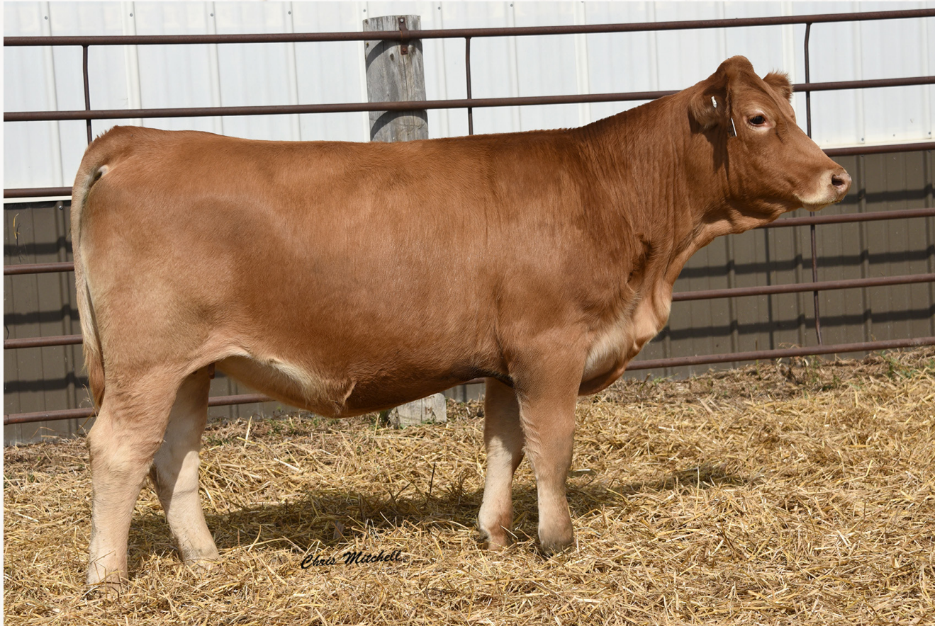
DCH HILLE J284 Sells as Lot 21.