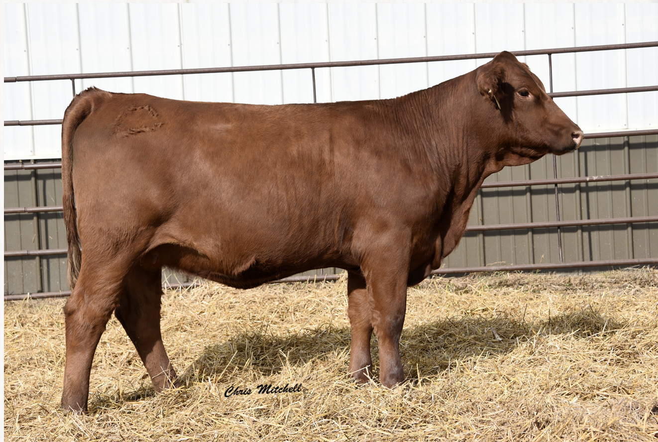
DCH HILLE J174 Sells as Lot 15.