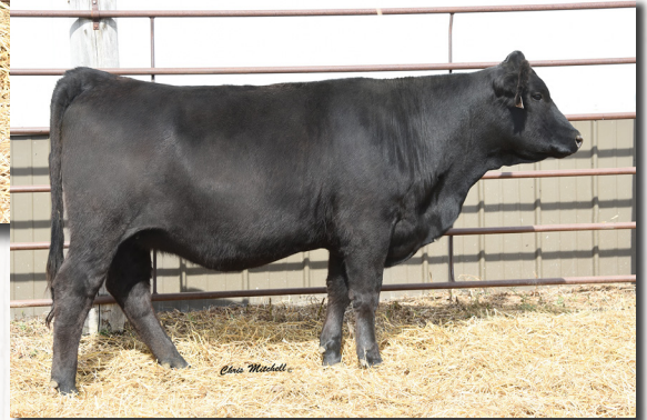
DCH HILLE J101 Sells as lot 11